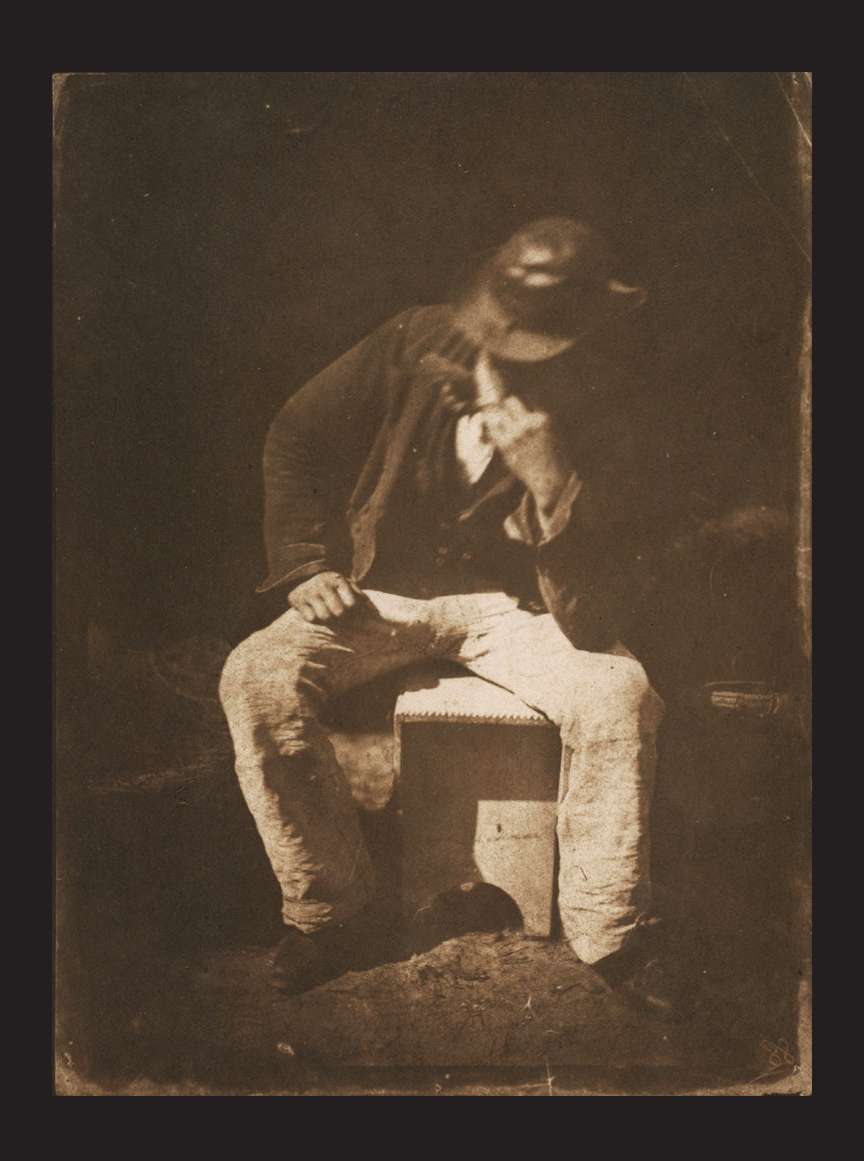
the drunken fisherman and other stories